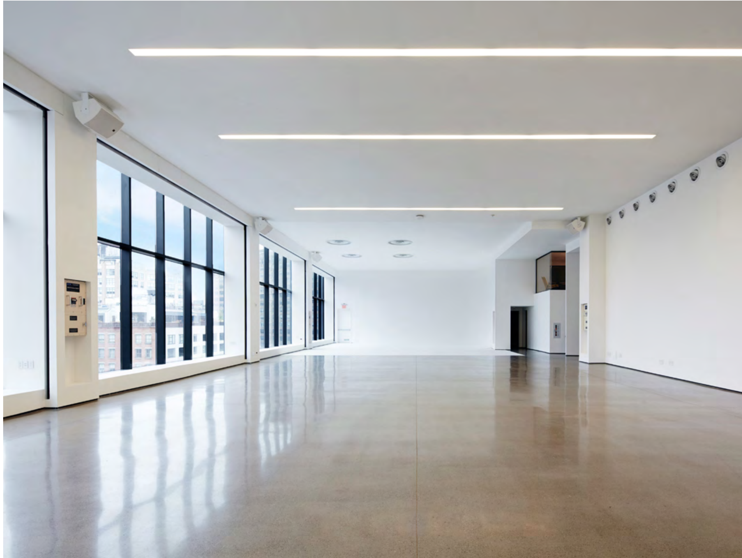
Truss not shown